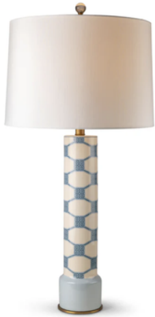
DUPONT KEY LAMP Port 68

Created in partnership with Winterthur, this classically shaped, greek key patterned lamp is both refined and stunning.