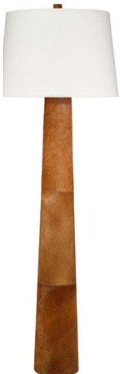
ROBERTSON FLOOR LAMP

Created using hand-twisted abaca rope, this flushmount provides the texture you never knew your fifth wall needed.