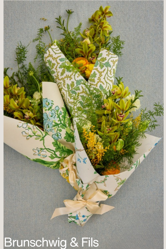
Brunschwig & Fils

Every product featured in this Atlanta Market edition has been chosen solely for its design, innovation, craftsmanship, materiality and market relevance. There are no paid placements, sponsored inclusions or advertising-driven selections—just a thoughtful edit of the introductions, collections and standout products we believe deserve your attention.