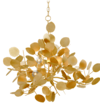
LUNARIA CHANDELIER Currey & Company Created to mimic the leaves of the Lunaria, this golden chandelier is a delicate sense of movement in wrought iron.

Created in partnership with Winterthur, this classically shaped, greek key patterned lamp is both refined and stunning.